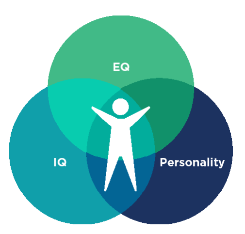
Emotional intelligence is an essential part of the whole person.

Personality is the final piece of the puzzle. It's the stable "style" that defines each of us. Personality is the result of hard-wired preferences, such as the inclination toward introversion or extroversion. However, like IQ, personality can't be used to predict emotional intelligence. Also, like IQ, personality is stable over a lifetime and doesn't change. IQ, emotional intelligence, and personality each cover unique ground and help to explain what makes a person tick.