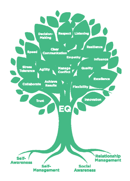
Emotional intelligence is the foundation for critical skills.

Naturally, people with a high degree of emotional intelligence make more money—an average of $29,000 more per year than people with a low degree of emotional intelligence. The link between emotional intelligence and earnings is so direct that every point increase in emotional intelligence adds $1,300 to an annual salary. These findings hold true for people in all industries, at all levels, in every region of the world. We haven't yet been able to find a job in which performance and pay aren't tied closely to emotional intelligence.